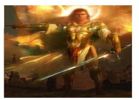
Treasure guarded By Hex and Curse And guard elemental

The following figure illustrates stages of Cosmic Fire blasting patterns revealing gold treasure. The first frame of the illustration is to show the gross level of protection. The second frame is to illustrate the curse protecting the treasure. The final stage shows the treasure after the curse has been removed.