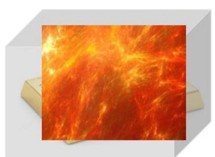
Treasure guarded By Hex and Curse only